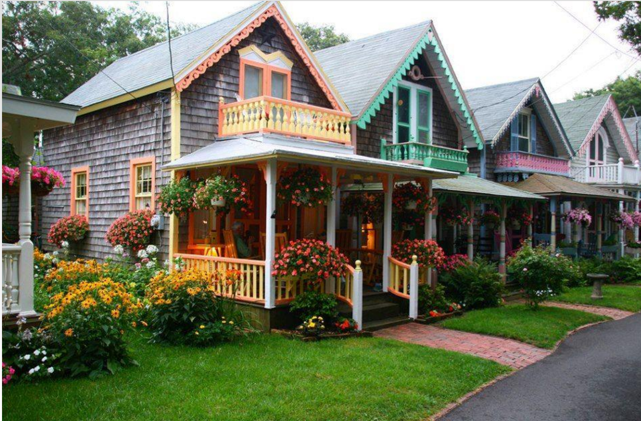
Oak Bluffs, Martha's Vineyard, 19 th Century