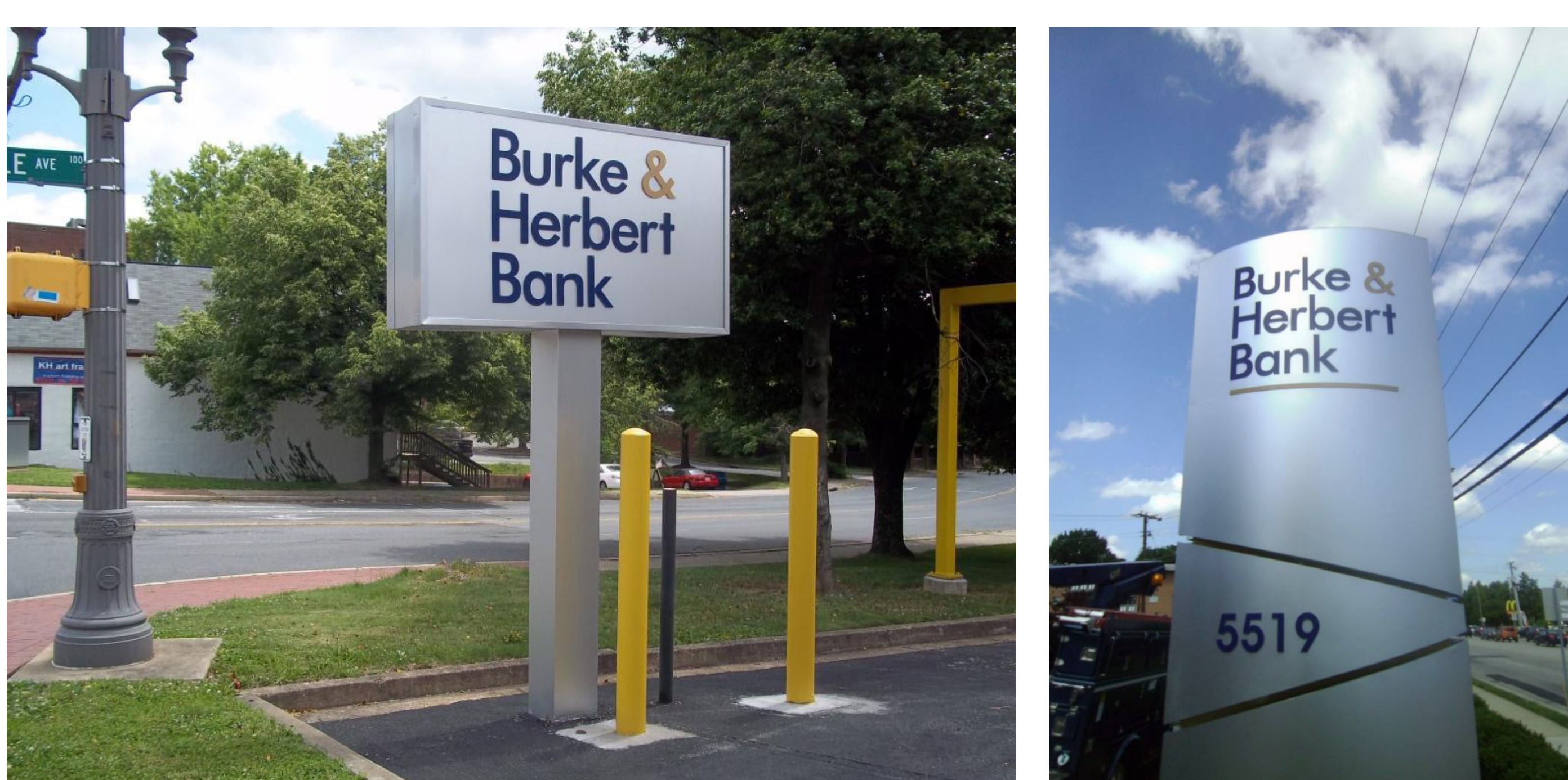
Existing Silver Pylon Sign West Broad St., Falls Church, VA