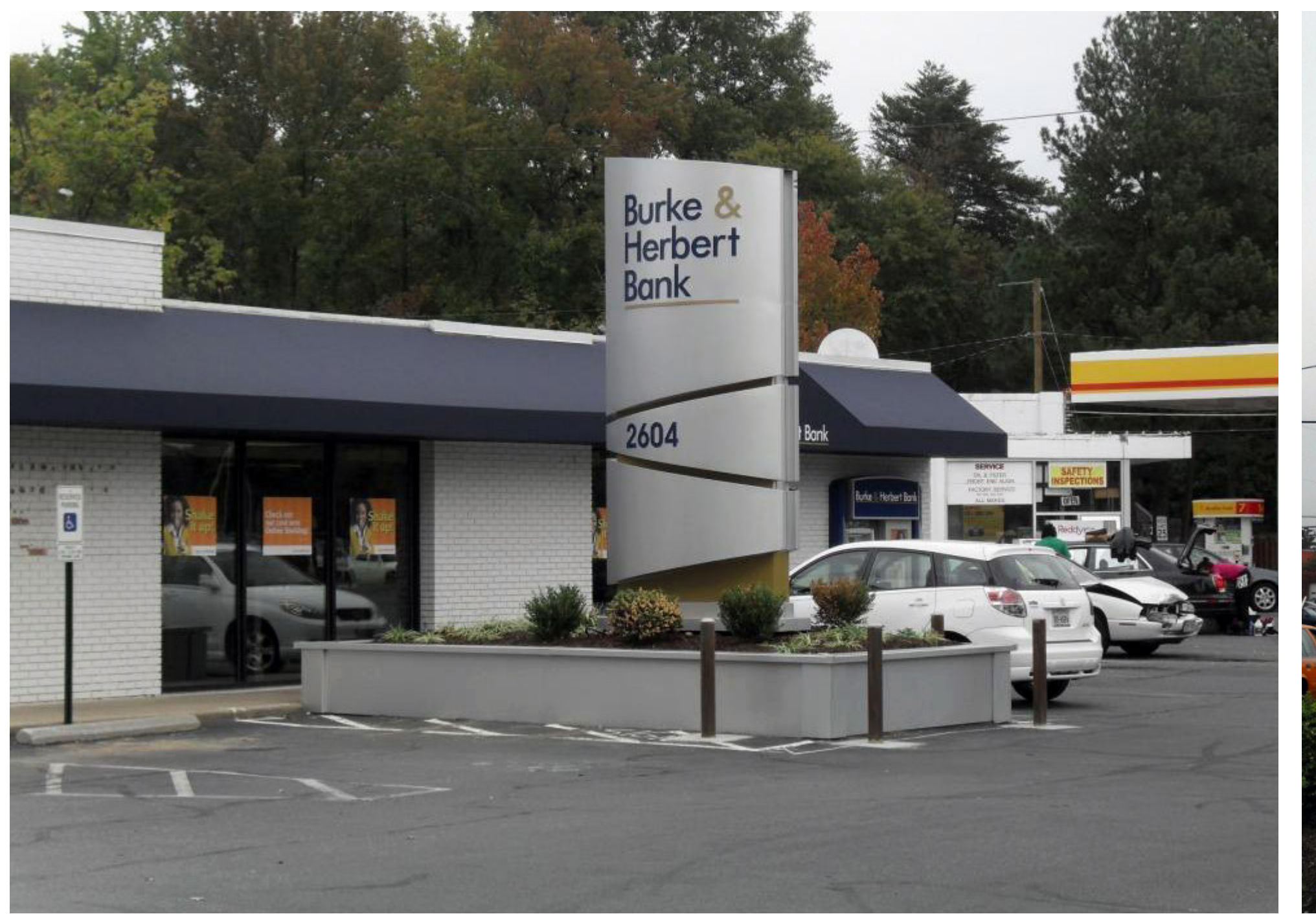
Existing Silver Pylon Sign Sherwood Hall Lane, Alexandria, VA