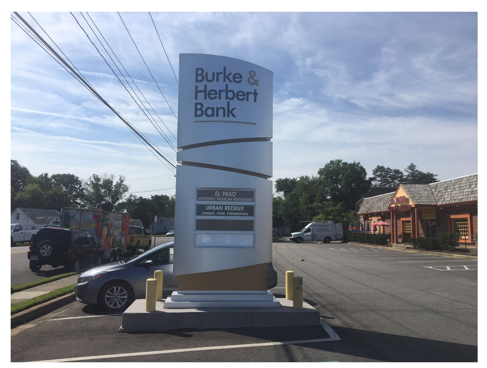
Existing Silver Pylon Sign Cooper Road, Alexandria, VA

Examples of existing Burke & Herbert Bank uses of silver metallic silver