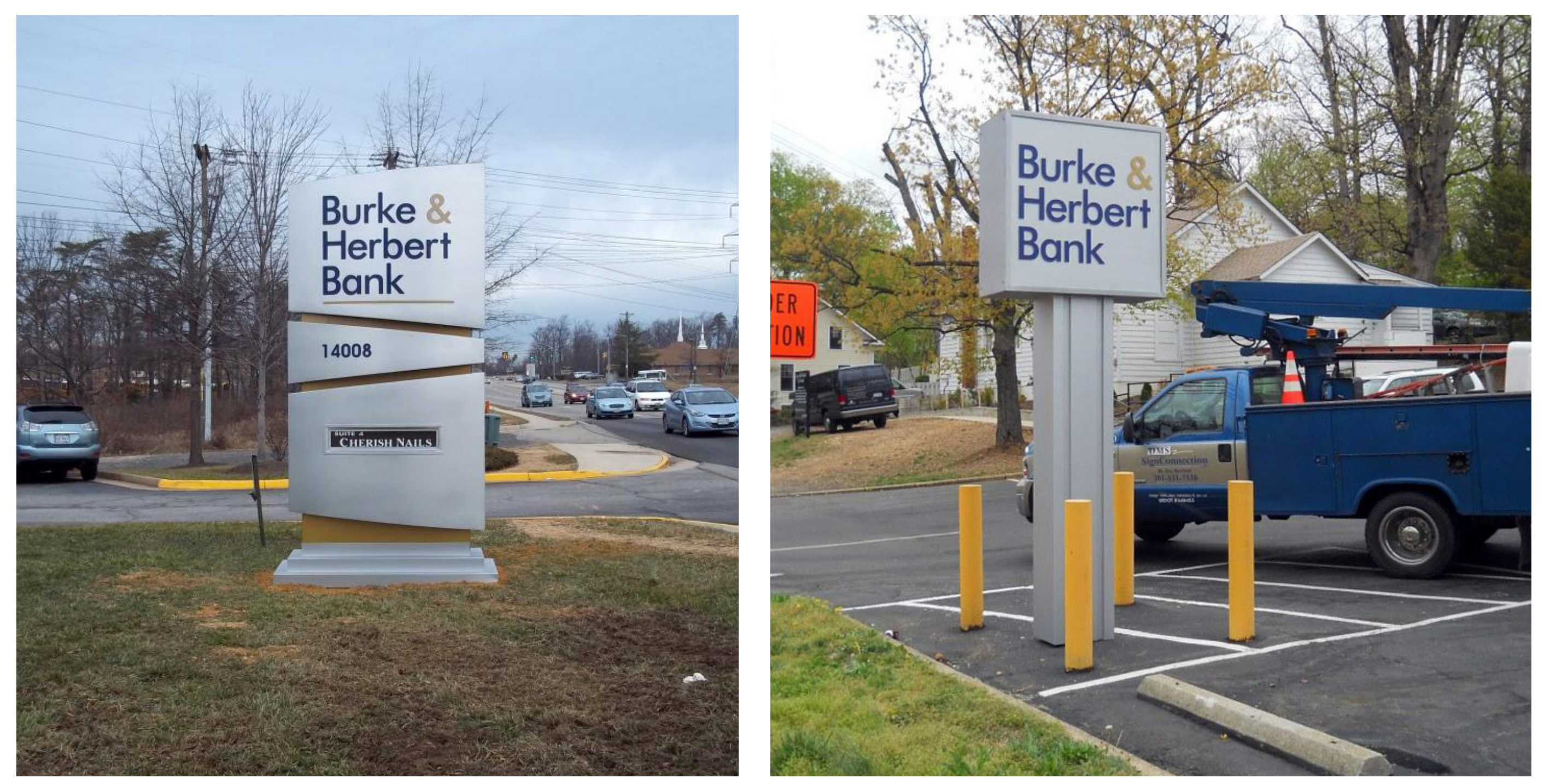
Existing Silver Pylon Sign Smoketown Rd, Woodbridge, VA