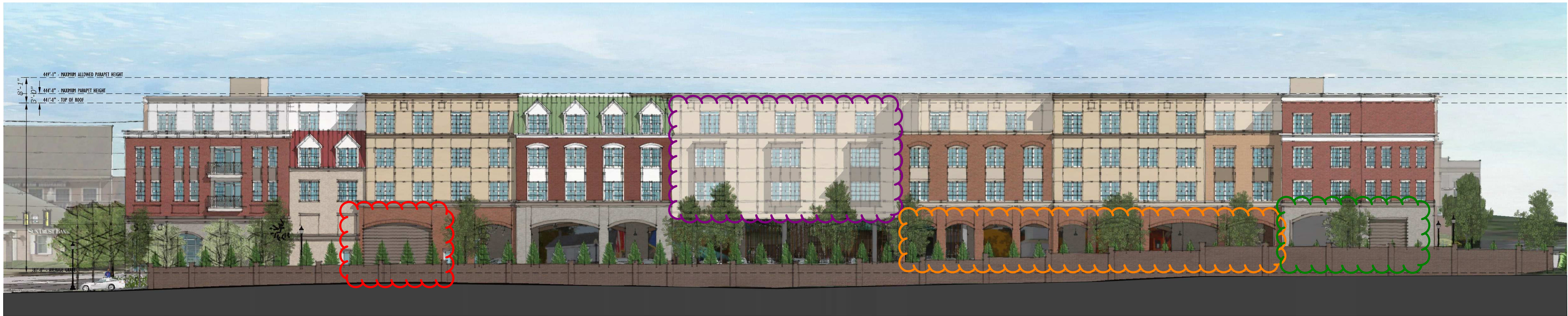
1 - REAR ELEVATION