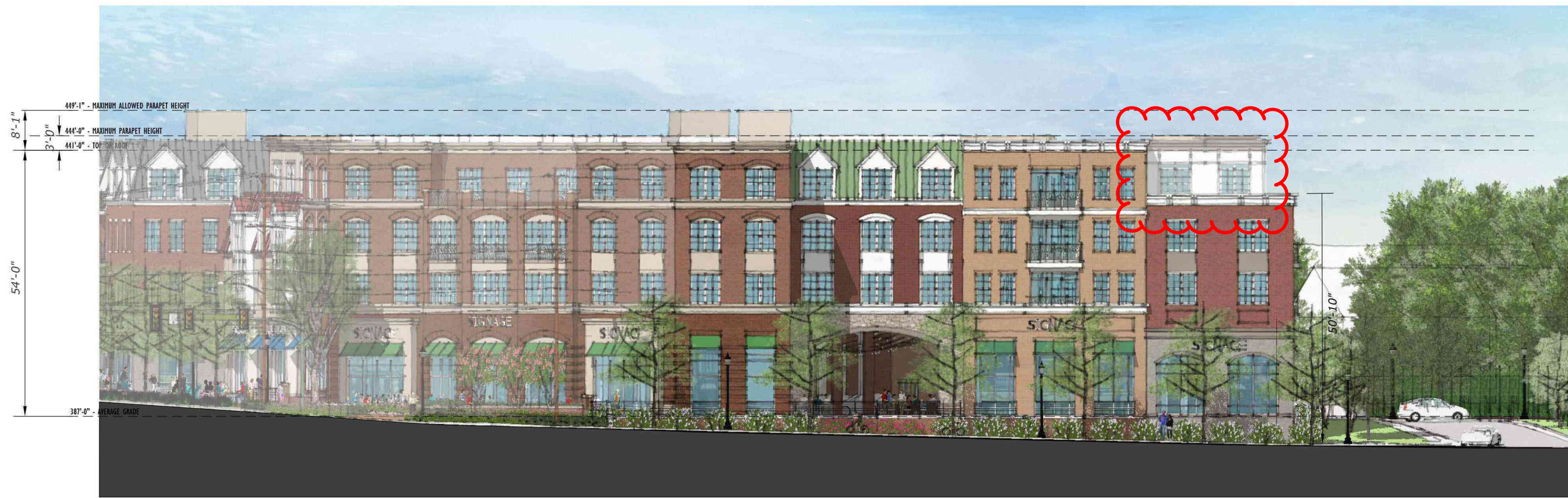
3 - NUTLEY STREET ELEVATION