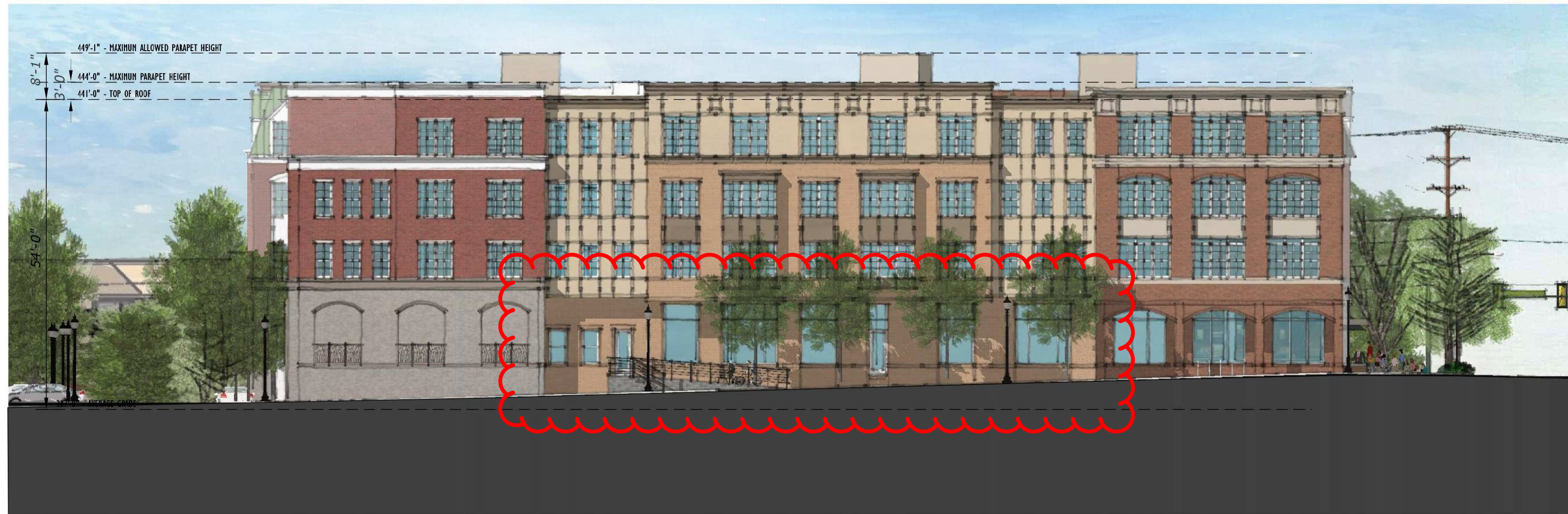
2 - SIDE ELEVATION