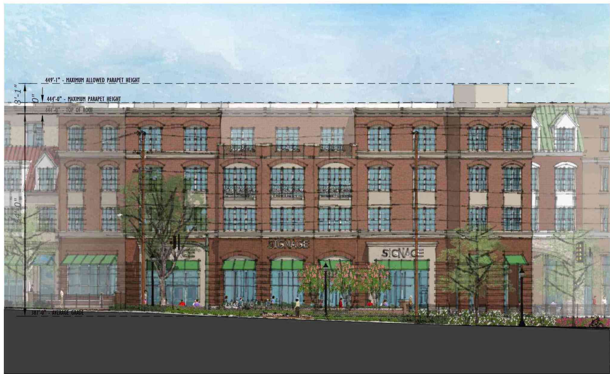
2 - CORNER ELEVATION