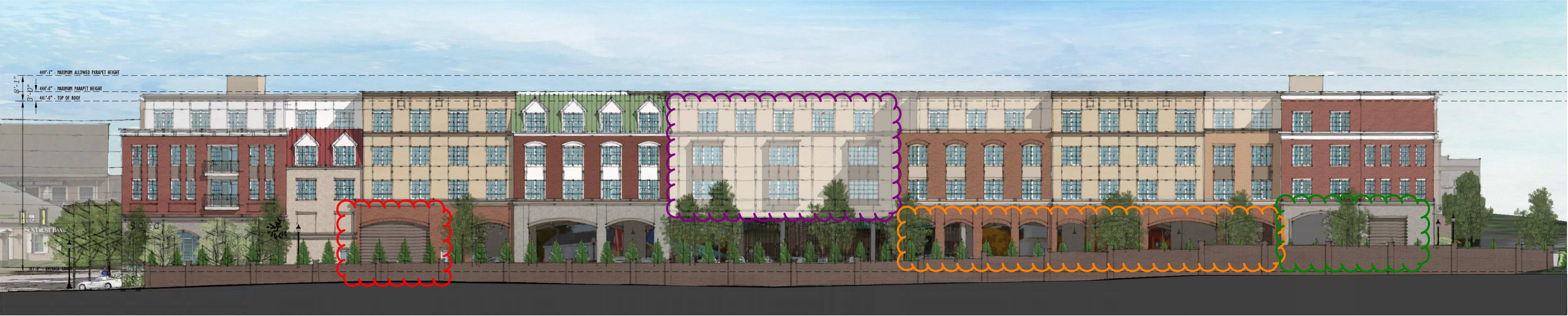
1 - REAR ELEVATION