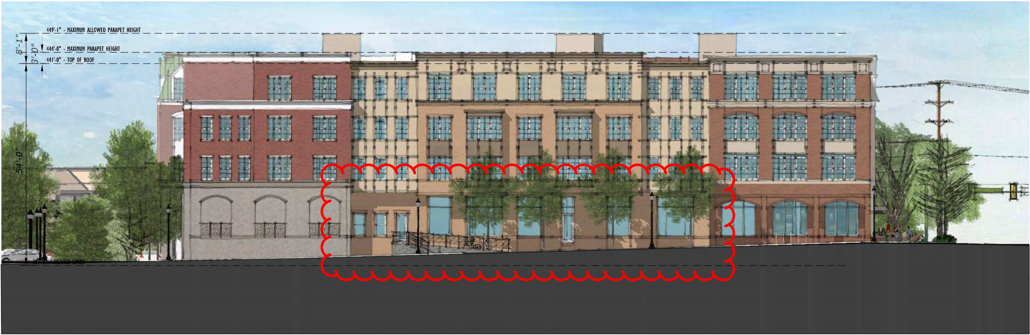
2 - SIDE ELEVATION