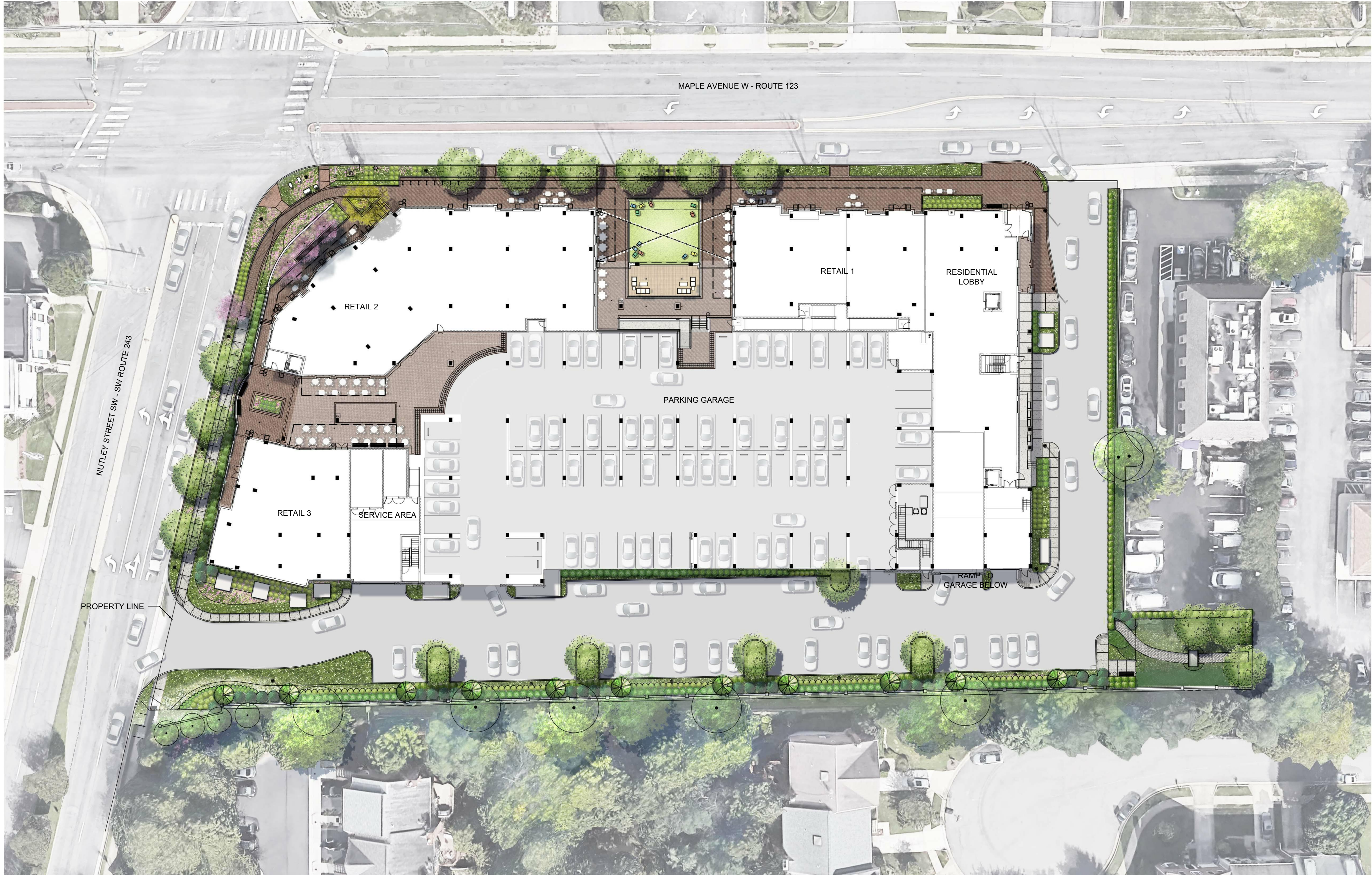
1 ILLUSTRATIVE SITE PLAN - STREET LEVEL

LS-101 ILLUSTRATIVE SITE PLAN STREET LEVEL