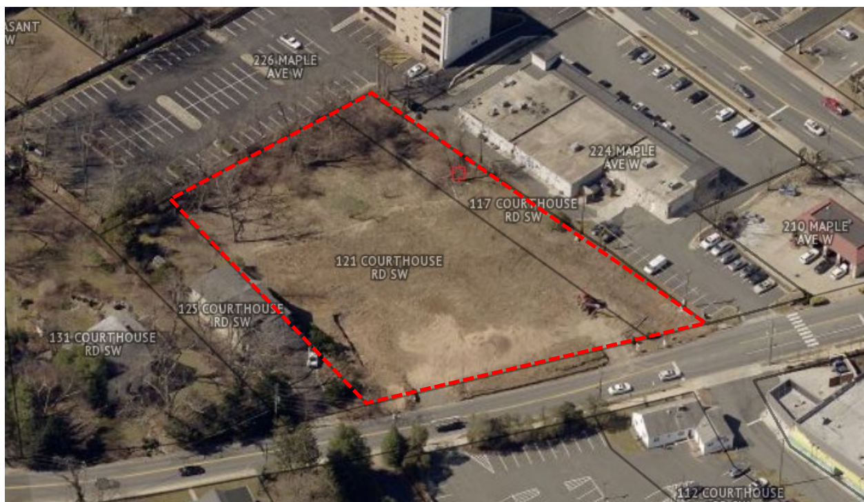
Figure 1 – Aerial image of site dated March 2021

Consideration of site plan modifications of requirements related to rezoning request for lot coverage, front yard setback, rear yard setback, and minimum lot area requirements.