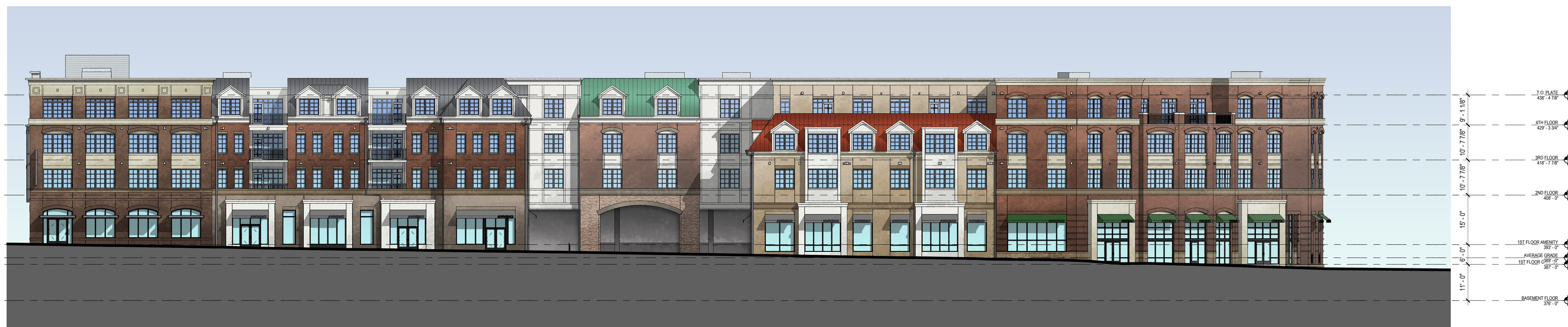
OVERALL NORTH ELEVATION