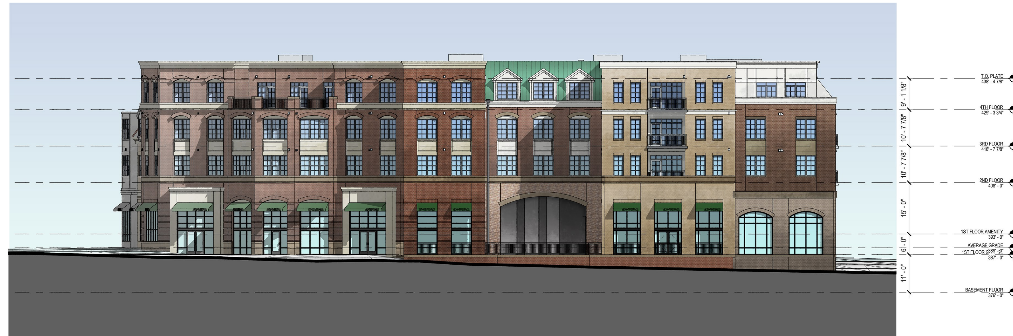
OVERALL WEST ELEVATION