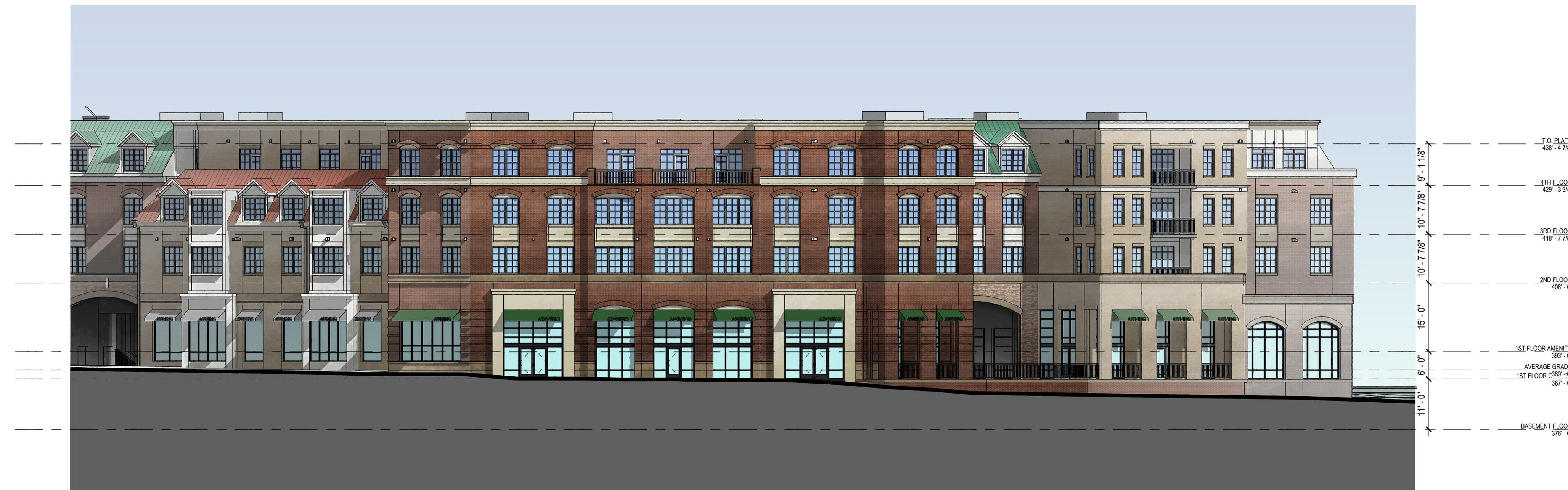
OVERALL NORTHWEST ELEVATION